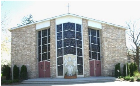
Infant Saviour, Pine Bush